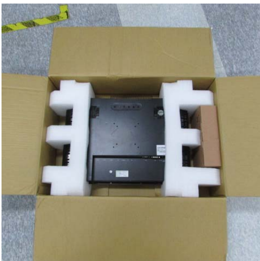
After test: packing carton